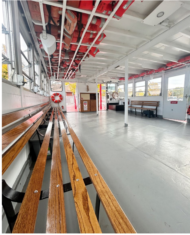
St. Charles II Belle Refresh