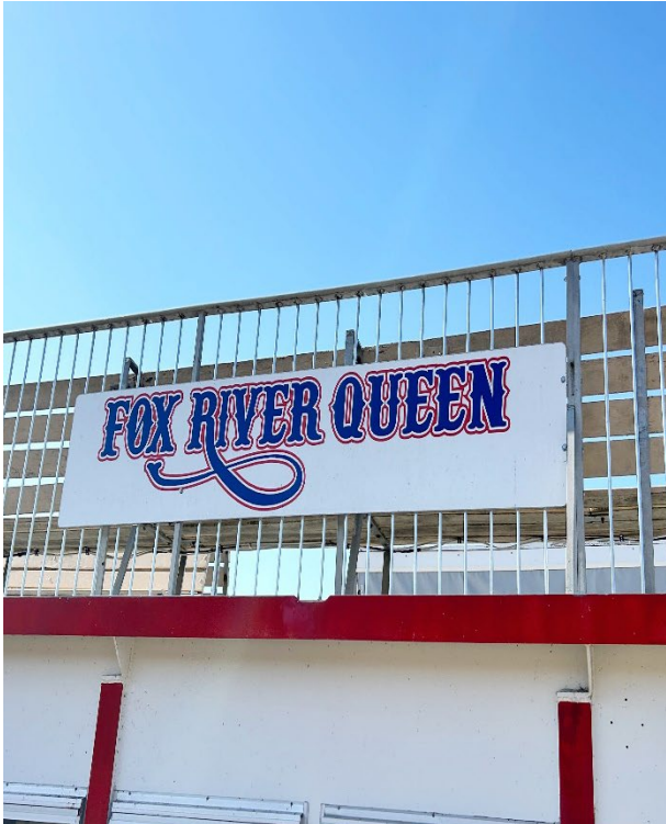
Fox River Queen Fence Rebuild